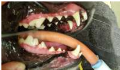
Looks normal at first glance

This is why we recommend Full Mouth Dental X-Ray: